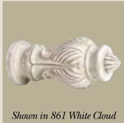
CWB114 Leaf Lamp Finial Size: 3" w x 3" h x 7" d For use with 1½" & 2" Poles