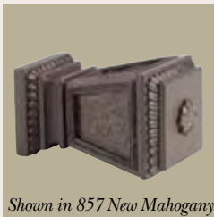
CWB102 Lantern in Leather Finial Size: 3 3/4" w x 3 3/4" h x 5 1/2" d For use with 1 3/8" & 2" Poles