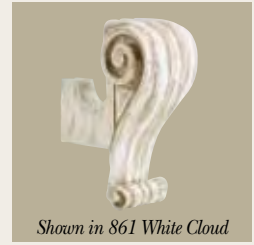
Shown in 861 White Cloud

CWB307 Scroll Bracket/Scarfholder Size: 4"w x 8½"h x 6½"d For use with 1¾" & 2" Poles Pole Support: U-Shape Clearance: 1½"