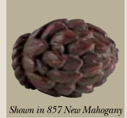
Shown in 857 New Mahogany