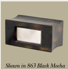
CWB106 Sophisticate Finial Size: 2 3/4" w x 2 3/4" h x 5 1/8" d For use with 1 3/8" & 2" Poles