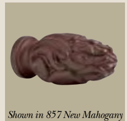
CWB111 Folded Leaf Finial Size: 3" w x 3" h x 7" d For use with 1 3/8" & 2" Poles