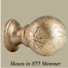
CWB101 Starlight Finial Size: 3 1/2" w x 3 1/2" h x 4 3/4" d For use with 1 3/8" & 2" Poles