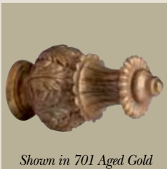
CWB900 Empress Finial Size: 3 1/2"w x 3 1/2"h x 6"d For use with 1 3/8" & 2" Poles