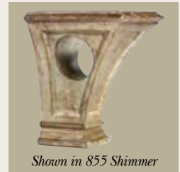
Shown in 855 Shimmer

CWB932 Cross Geometric Sconce Bracket/Scarfholder Size: 4½"w x 7½"h x 6½"d For use with 1¾" & 2" Poles Pole Support: 2¾" hole Clearance: 1½"