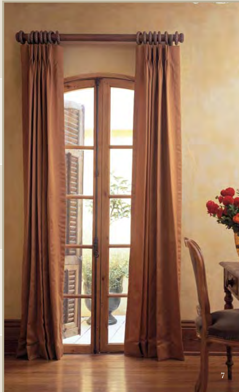
Featured here: Kirsch ® Buckingham Rope End Caps in Brandywine finish with coordinating Rope Brackets and 2" Rope Rings.