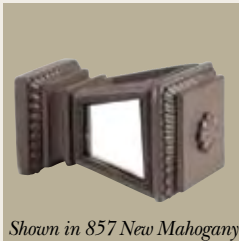
CWB104 Lantern with Antique Mirror Panels Finial Size: 3 3/4" w x 3 3/4" h x 5 1/2" d For use with 1 3/8" & 2" Poles