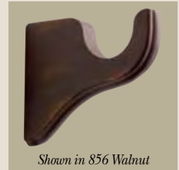
Shown in 856 Walnut

CWB504 Fluted Bracket Size: 1" w x 4¾" h x 7" d For use with 3" Pole Clearance: 3"