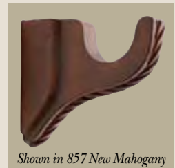
Shown in 857 New Mahogany

CWB917 Rope Bracket Size: 1" w x 4¾" h x 5¾" d For use with 2" Pole Clearance: 2½"