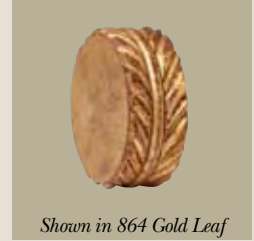
Shown in 864 Gold Leaf

CWB941 Leaf Lamp End Cap Size: 2¼" w x 2¾" h x 1¼" d For use with 1½" & 2" Poles