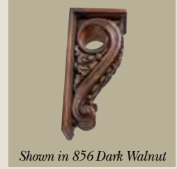
Shown in 856 Dark Walnut

CWB305 Traditional Sconce Bracket/Scarfholder Size: 4¾"w x 11"h x 5½"d For use with 1¾" & 2" Poles Pole Support: 2¾" hole Clearance: 1"