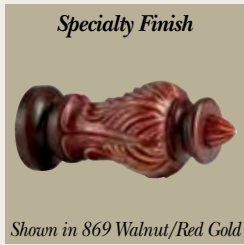
CWB114 Leaf Lamp Finial Size: 3" w x 3" h x 7" d For use with 1½" & 2" Poles