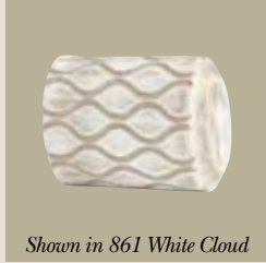
CWB113 Waves Finial Size: 2½" w x 3¾" h x 5" d For use with 1½" & 2" Poles