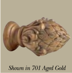
CWB228 Pineacanthus Finial Size: 3 1/2"w x 3 1/2"h x 7"d For use with 1 3/8" & 2" Poles