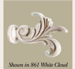
CWB223 Leaf Dance Finial Size: 2½" w x 6" h x 7½" d For use with 1½" & 2" Poles