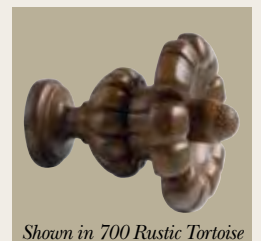
CWB225 Floral Urn Finial Size: 5" w x 5" h x 7" d For use with 1½" & 2" Poles