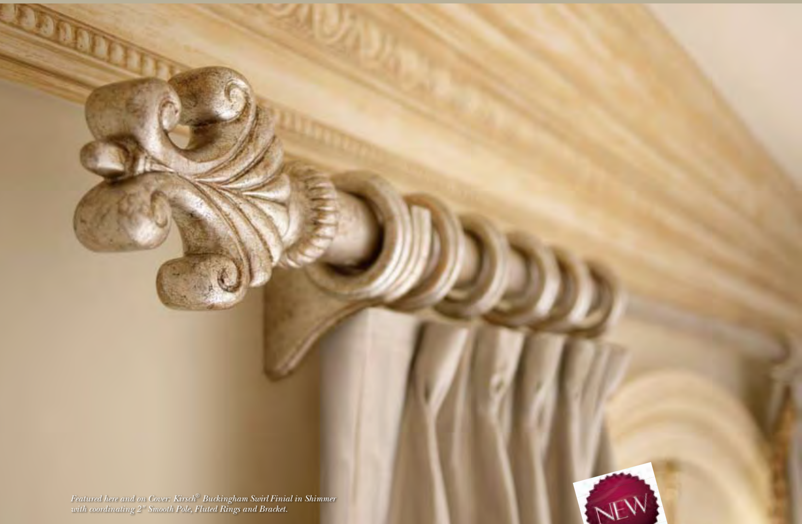
Featured here and on Cover: Kirsch® Buckingham Swirl Finial in Shimmer with coordinating 2" Smooth Pole, Fluted Rings and Bracket.