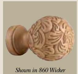
CWB109 Paisley Ball Finial Size: 3 1/4" w x 3 1/4" h x 5 1/2" d For use with 1 3/8" & 2" Poles