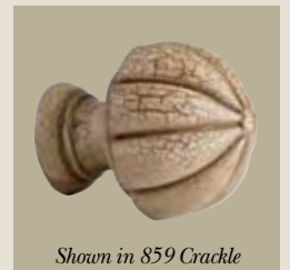
CWB224 Cone Flower Finial Size: 3¾" w x 3¾" h x 5¾" d For use with 1½" & 2" Poles