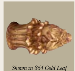
Shown in 864 Gold Leaf

CWB255 Acanthus Leaf Finial Size: 4¾" w x 4¾" h x 9" d For use with 3" Pole