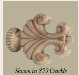
CWB108 Swirl Finial Size: 3" w x 5 5/8" h x 8" d For use with 1 3/8" & 2" Poles