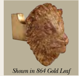
Shown in 864 Gold Leaf

CWB325 Lion Bracket Bracket/Scarfholder Size: 5¼"w x 7"h x 4¾"d For use with 1¾" & 2" Poles Pole Support: U-Shape Clearance: 1½"