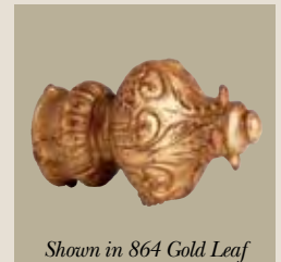
Shown in 864 Gold Leaf