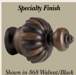
CWB208 Windsor Finial Size: 4" w x 4" h x 7½" d For use with 1½" & 2" Poles