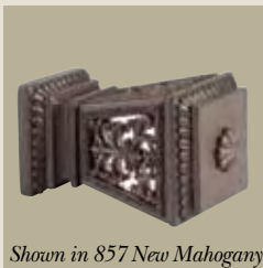
CWB105 Lantern with Antique Mirror Panels and Filigree Insert Finial Size: 3 3/4" w x 3 3/4" h x 5 1/2" d For use with 1 3/8" & 2" Poles