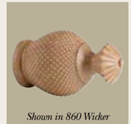
Shown in 860 Wicker