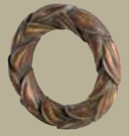
Shown in 794 Brandywine

CWB327 Leaf Scarf Ring Size: 5"w x 5"h x 3/4"d Inner Diameter: 3" Outer Diameter: 5"