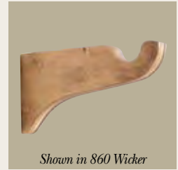
Shown in 860 Wicker

CWB503 Fluted Bracket Size: ¾" w x 4" h x 7½" d For use with 1½" Poles Clearance: 5¼"