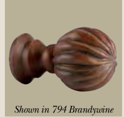
CWB107 Twisted Ball Finial Size: 3 1/2" w x 3 1/2" h x 5 3/4" d For use with 1 3/8" & 2" Poles