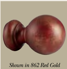
CWB559 Wood Ball Finial Size: 3 3/8"w x 3 3/8"h x 5 1/4"d For use with 2" Pole