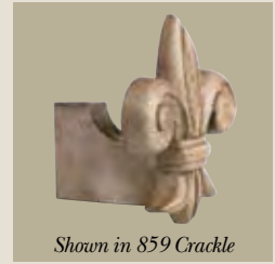
Shown in 859 Crackle

CWB309 Fleur de Lis Bracket/Scarfholder Size: 6"w x 6¾"h x 5"d For use with 1¾" & 2" Poles Pole Support: U-Shape Clearance: 1½"