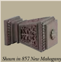
CWB103 Lantern in Leather with Filigree Insert Finial Size: 3 3/4" w x 3 3/4" h x 5 1/2" d For use with 1 3/8" & 2" Poles