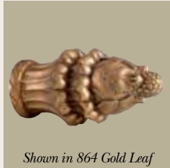
CWB201 Acanthus Leaf Finial Size: 3½" w x 3½" h x 6" d For use with 1½" & 2" Poles