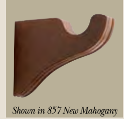
Shown in 857 New Mahogany

CWB502 Fluted Bracket Size: ¾" w x 3¾" h x 5¼" d For use with 1½" Pole Clearance: 3"