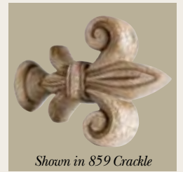
CWB215 Fleur de Lis Finial Size: 2½" w x 5¼" h x 7½" d For use with 1½" & 2" Poles