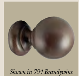
Shown in 794 Brandywine

CWB254 Wood Ball Finial Size: 4½" w x 4½" h x 6½" d For use with 3" Pole