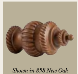
CWB112 Traditional Rope Finial Size: 3" w x 3" h x 7" d For use with 1 3/8" & 2" Poles