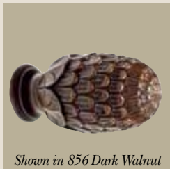
CWB203 Pine Cone Finial Size: 3" w x 3" h x 6" d For use with 1½" & 2" Poles