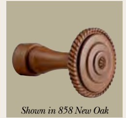
CWB946 Rope Holdback Size: 5"w x 5"h x 7½"d