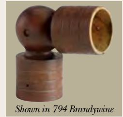
Shown in 794 Brandywine

CWB5506 Swivel Socket For use with 2" Pole