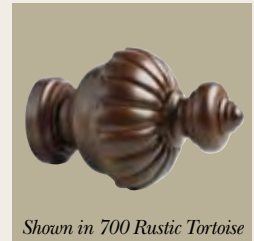
Shown in 700 Rustic Tortoise

CWB250 Windsor Finial Size: 5¼" w x 5¼" h x 9" d For use with 3" Pole