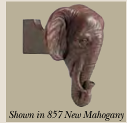
Shown in 857 New Mahogany

CWB326 Elephant Bracket Bracket/Scarfholder Size: 6¾"w x 7¾"h x 3¾"d For use with 1¾" & 2" Poles Pole Support: U-Shape Clearance: 1½"