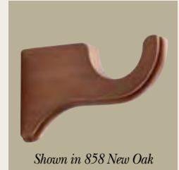
Shown in 858 New Oak

CWB505 Fluted Bracket Size: 1" w x 4¾" h x 8½" d For use with 3" Pole Clearance: 4½"