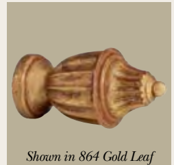
CWB110 Sleek Urn Finial Size: 3 3/8" w x 3 3/4" h x 6" d For use with 1 3/8" & 2" Poles