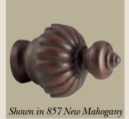
CWB208 Windsor Finial Size: 4" w x 4" h x 7½" d For use with 1½" & 2" Poles